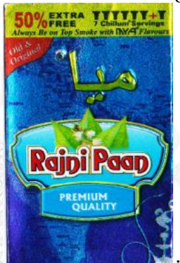
RAJNI PAAN, RAJNIPAAN. trademarks RAJNI,

(i) Adecree of permanent injunction restraining the Defendants, their partners or proprietors, principal officers, servants, agents and distributors and all others acting on its behalf as the case may be from manufacturing, selling, offering for sale, advertising, directly or indirectly dealing in any manner with products including but not limited to tobacco products, pan masala products, confectionary and/or any other goods and/or services using the mark